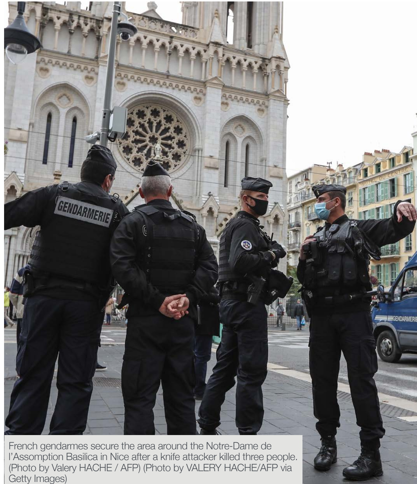
French gendarmes secure the area around the Notre-Dame de l'Assomption Basilica in Nice after a knife attacker killed three people.

The attack was likely, at least in part, inspired to the beheading of Samuel Paty in Paris two weeks earlier. Religious sites, both Christian and Jewish, have been frequently targeted by Islamist extremists in France. While iconic religious sites like major Cathedrals will have terrorist risk mitigation measures, there is often very little protective security at smaller churches, making them relatively soft targets for mass casualty attacks.