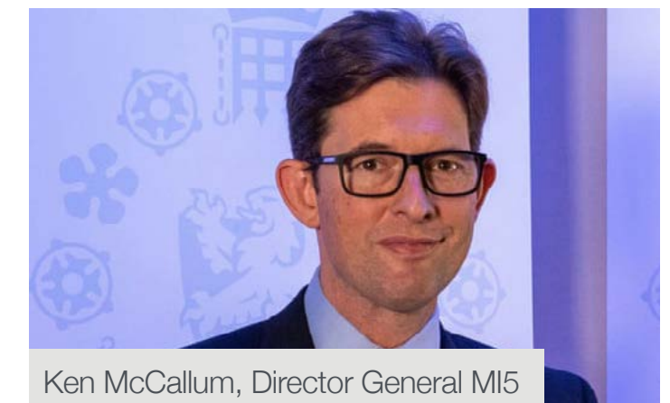
Ken McCallum, Director General MI5

The new Director General of MI5, Ken McCallum, gave a speech on the current national security threats facing the UK on 14 October. McCallum emphasised the threats from hostile states such as China, Iran and Russia, but also underscored that the agency's largest mission remains countering terrorism.