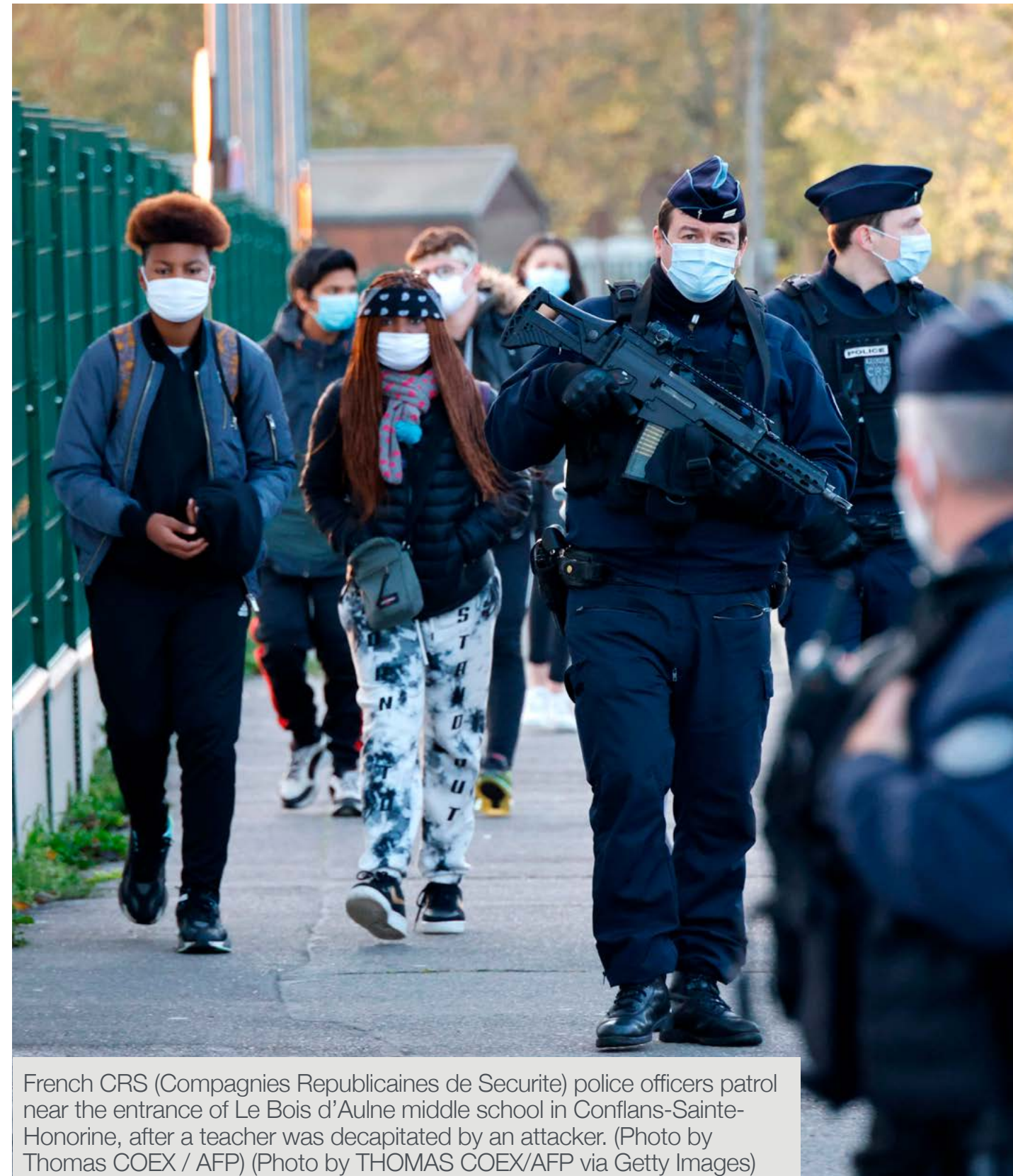
French CRS (Compagnies Republicaines de Securite) police officers patrol near the entrance of Le Bois d'Aulne middle school in Conflans-Sainte-Honorine, after a teacher was decapitated by an attacker.

The impact of such targeted attacks is sometimes restricted to immediate vicinity of the incident. However, they can also develop into extensive and violent manhunts with a much wider area impacted, as occurred following the 2015 Charlie Hebdo shooting and 2015 Copenhagen Great