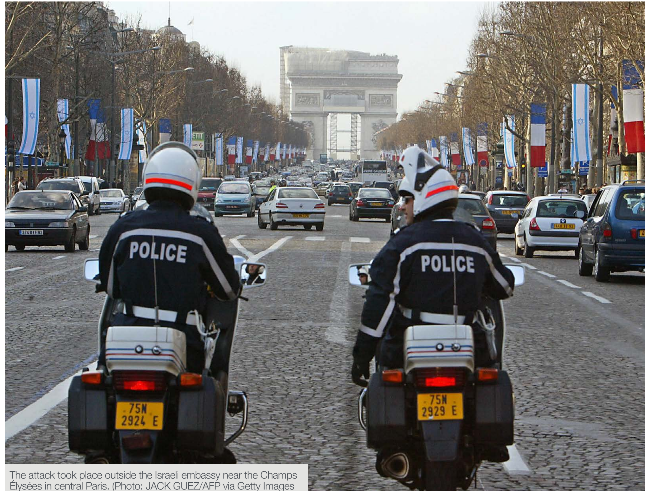
The attack took place outside the Israeli embassy near the Champs Élysées in central Paris.

While Islamist extremist plots in Europe often involve multi-national co-conspirators, an entirely foreign cell launching attacks in a neighbouring country (if this is indeed the case) is unusual. There is realistic possibility those involved were motivated by the political furore which followed the beheading of Samuel Paty.